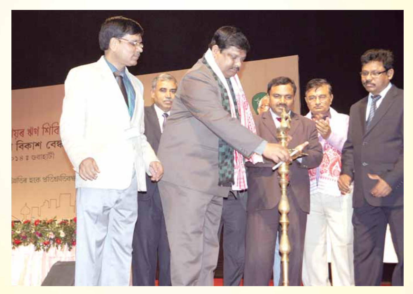
Lighting of lamp by Shri Rockybul Hussain, Minister, P&RD and Forest, Govt. of Assam in State Level Credit Camp

Inaugurating the Credit Camp, Shri Rockybul Hussain, Hon'ble Minister, Panchayat & Rural Development and Forest, Govt. of Assam lauded the efforts of AGVB for extending credit to over 75000 beneficiaries in a single day and called upon the other Banks to follow the example set by AGVB. The Minister also informed that due to the pro-active role of Assam Gramin Vikash Bank, the Govt. of Assam has given the responsibility of disbursement of wages of the MGNREGA beneficiaries in twelve districts of the State. The Minister also appreciated the steps taken by AGVB for implementation of Financial Inclusion Plan in the allotted villages. The Minister hoped that the initiatives of Assam Gramin Vikash Bank to provide credit at the door - step will usher in a new era for the people of Assam.