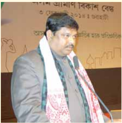
Shri Rockybul Hussain, Hon'ble Minister delivering inaugural speech

The other dignitaries, in their addresses, expressed happiness in various initiatives taken by the Bank for the uplift of the economy of the State as well as solving unemployment problems. Further, the dignitaries were impressed seeing the huge gathering and appreciated the efforts made by the Bank in successful organisation of such a mega event which is considered to be the largest Credit Camp organised by any Bank in the entire N. E. Region.