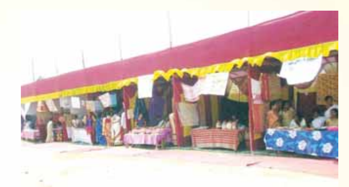
SHG stalls at Buyers - Sellers meet