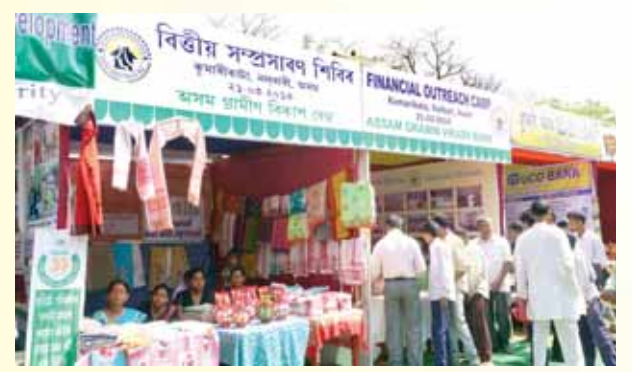
A view of AGVB's stall at Financial Outreach camp

Our Bank also participated in the Outreach camp and put up stall to educate the rural masses about Bank's products and another stall was also put up by Puwati SHG, financed by AGVB, Jagara branch.